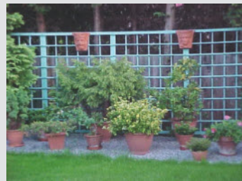
TRELLIS AND POTS

250mls (selected colours only) 750mls 2.5litre 5litre 20litre (selected colours only)