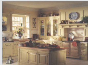
M D F